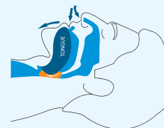
FIGURE 2 Relaxed jaw position, tongue and throat tissue collapse, restricting breathing